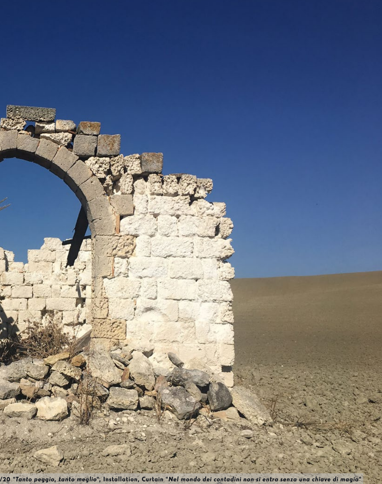
Cotton fabric, linseed oil, graphite / In the outskirts of Matera (IT) lled as soon as the owner (83 years old farmer) gave his permission. He is thinking since the two and a halth month now. From time to time we talk on the phone.