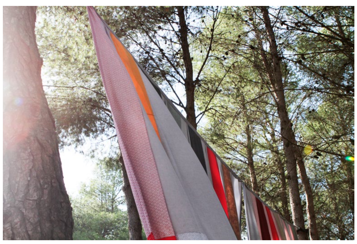
2019/20 "Tanto peggio, tanto meglio", Installation, Curtain "Assai" Different cotton fabrics of the Brancaccio residence, cotton thread / Residenza Brancaccio, Via degli Etruschi, Matera (IT)